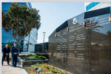
The revealing of the Wall of Honor