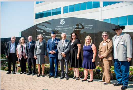
Gen Ellen Pawlikowski family & friends